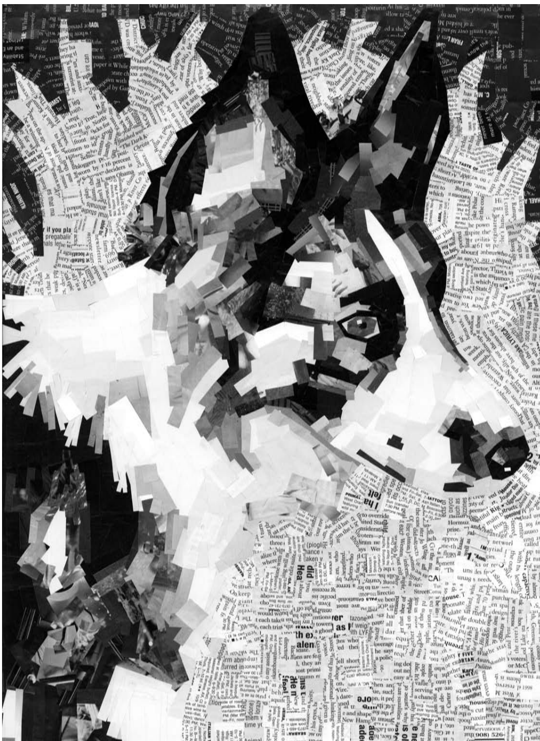
Front and Back Photo Credit: Wesley Roberts