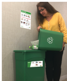
Consolidate smaller recycling containers into a larger, liner-free container.