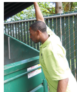
Double check recycling bin to make sure it's free from contaminants; no plastic bags or liners and all recyclables are loose in the bin.

For more tools and resources to help you recycle right, visit wm.com/recycle right