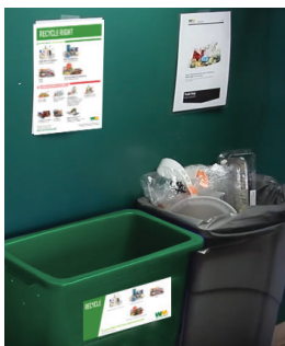
Place clean, dry materials in recycling container.