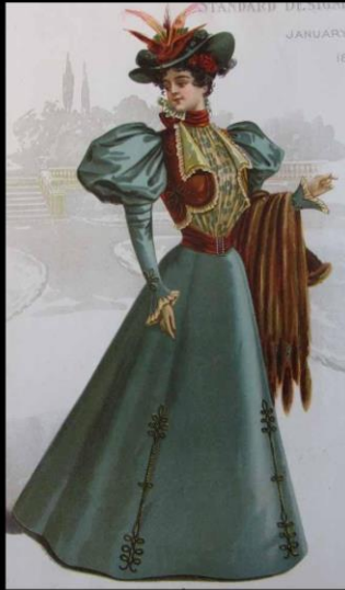
Lady Bracknell - Act I

Curated Images from Historic Fashion Plates, Archival Garments from Museum Exhibits, Editorial Images, and Film Stills.