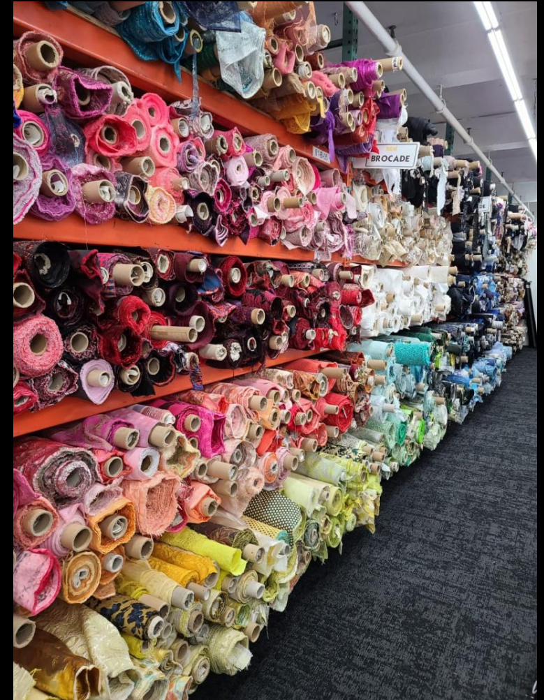
<<< - Ramapo Students on a Swatching Field Trip in NYC.