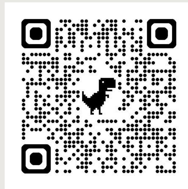
New Student Housing Guide