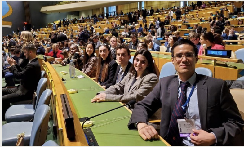
Model UN Club at the UN in New York City