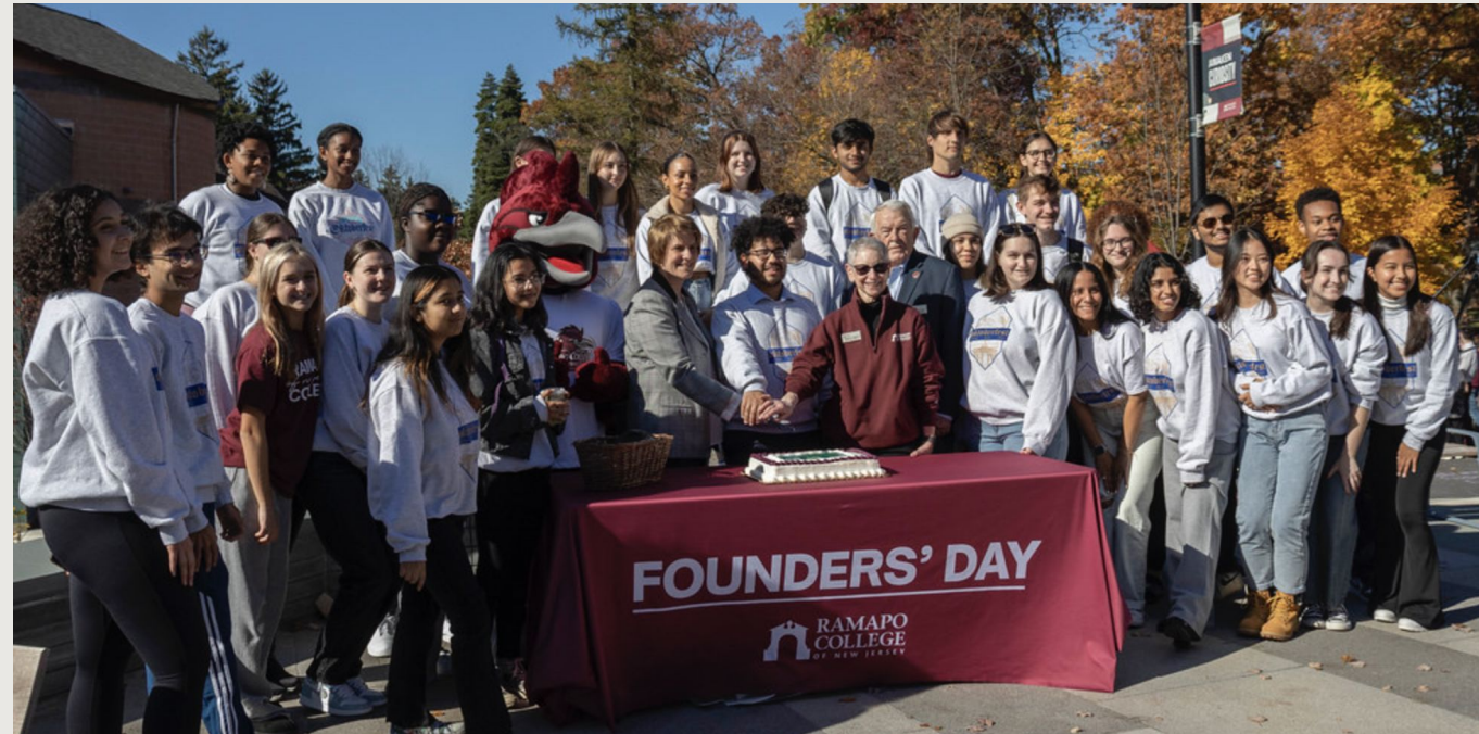
SGA celebrates Founders' Day - the College's birthday!