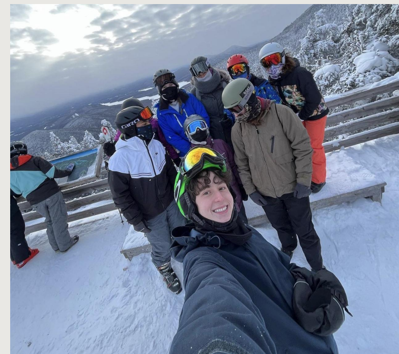
RCNJ Ski and Snowboard Club at Whiteface Mountain