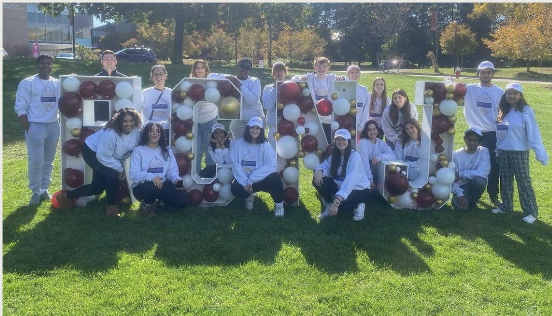
Family Day & Oktoberfest