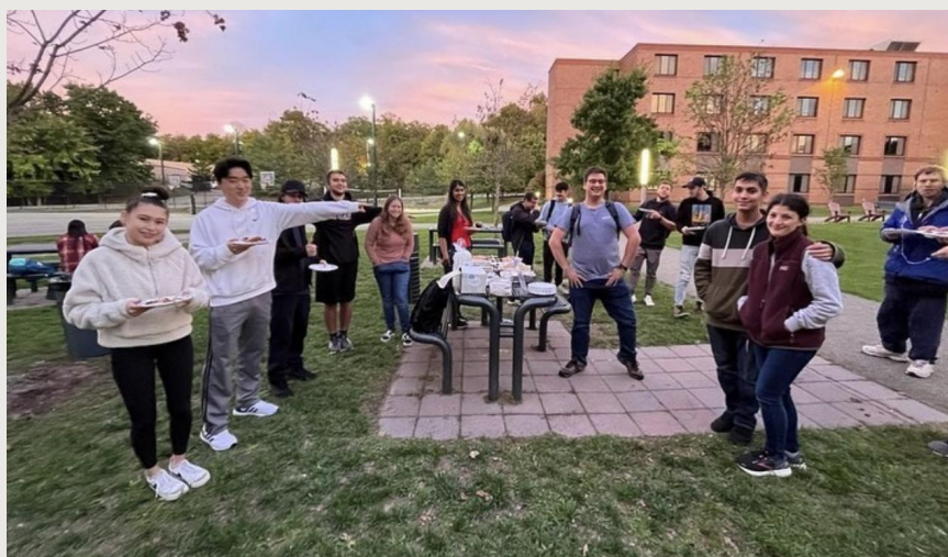
Hillel Fall BBQ