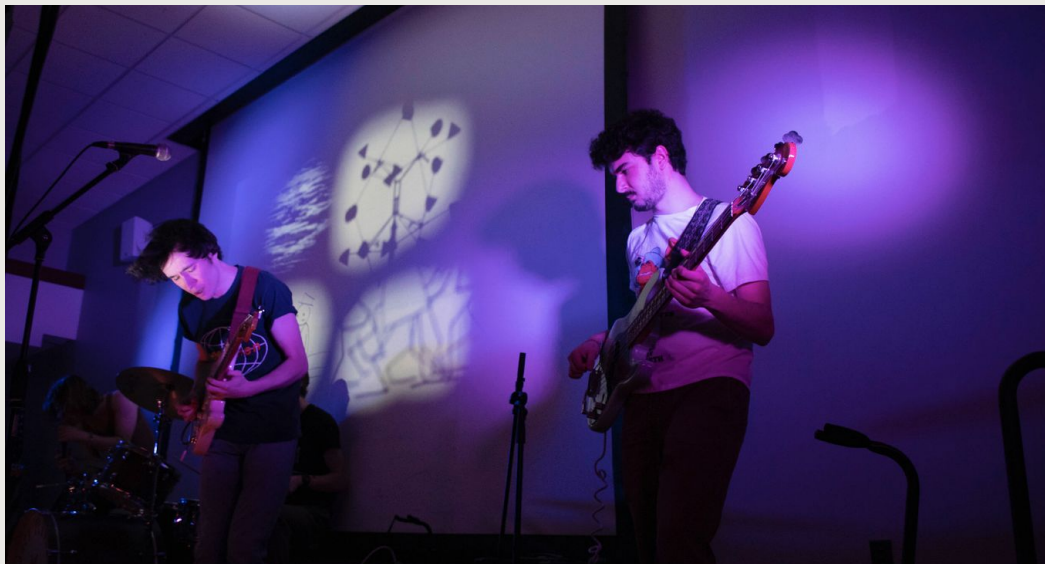
Tuesday Night Live Concert Series