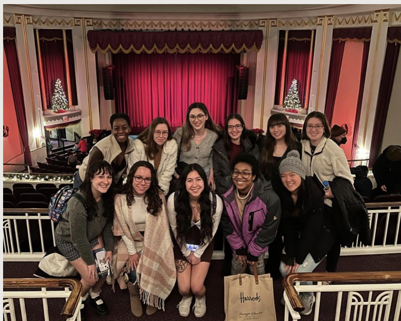
RCNJ Dance Company seeing the Nutcracker