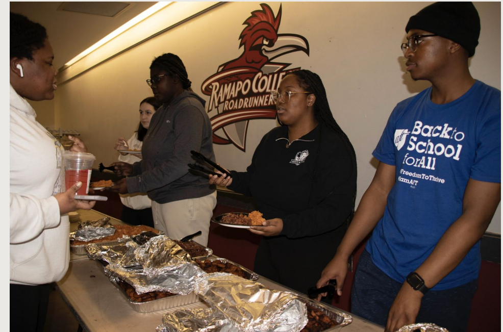
Taste of Africa Food Event