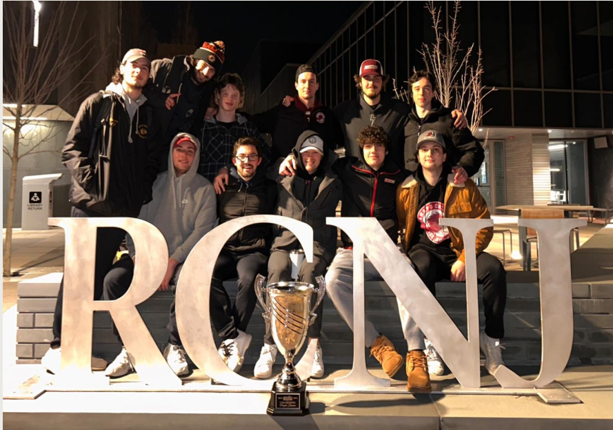
Ramapo College Ice Hockey celebrating their 2023 Empire Championship