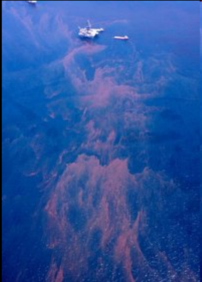
BP Oil Spill, Gulf of Mexico, April '10