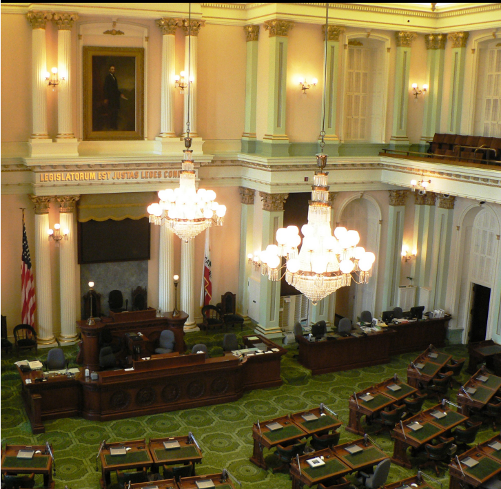
California State Assembly Wikimedia Commons Photo by Davis Monniaux, 2005