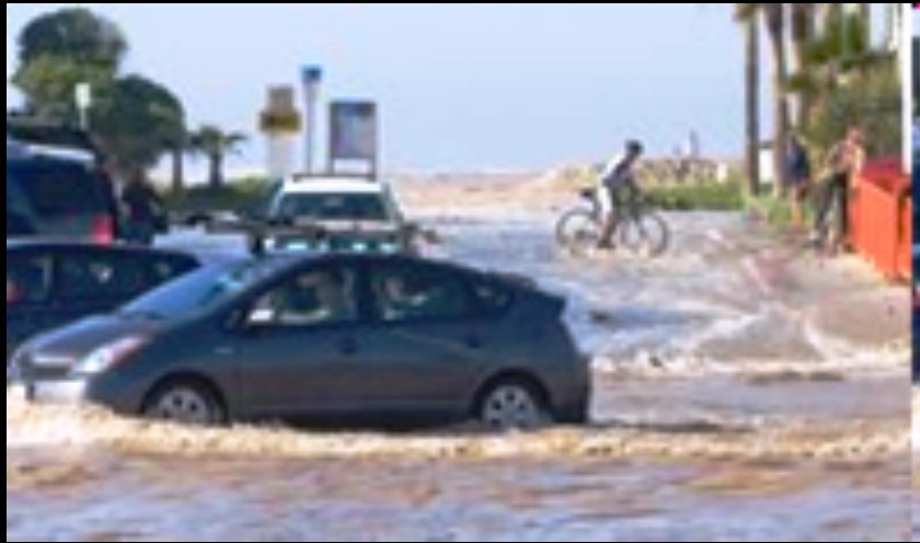
Sunset Beach, Orange County, CA, 2010