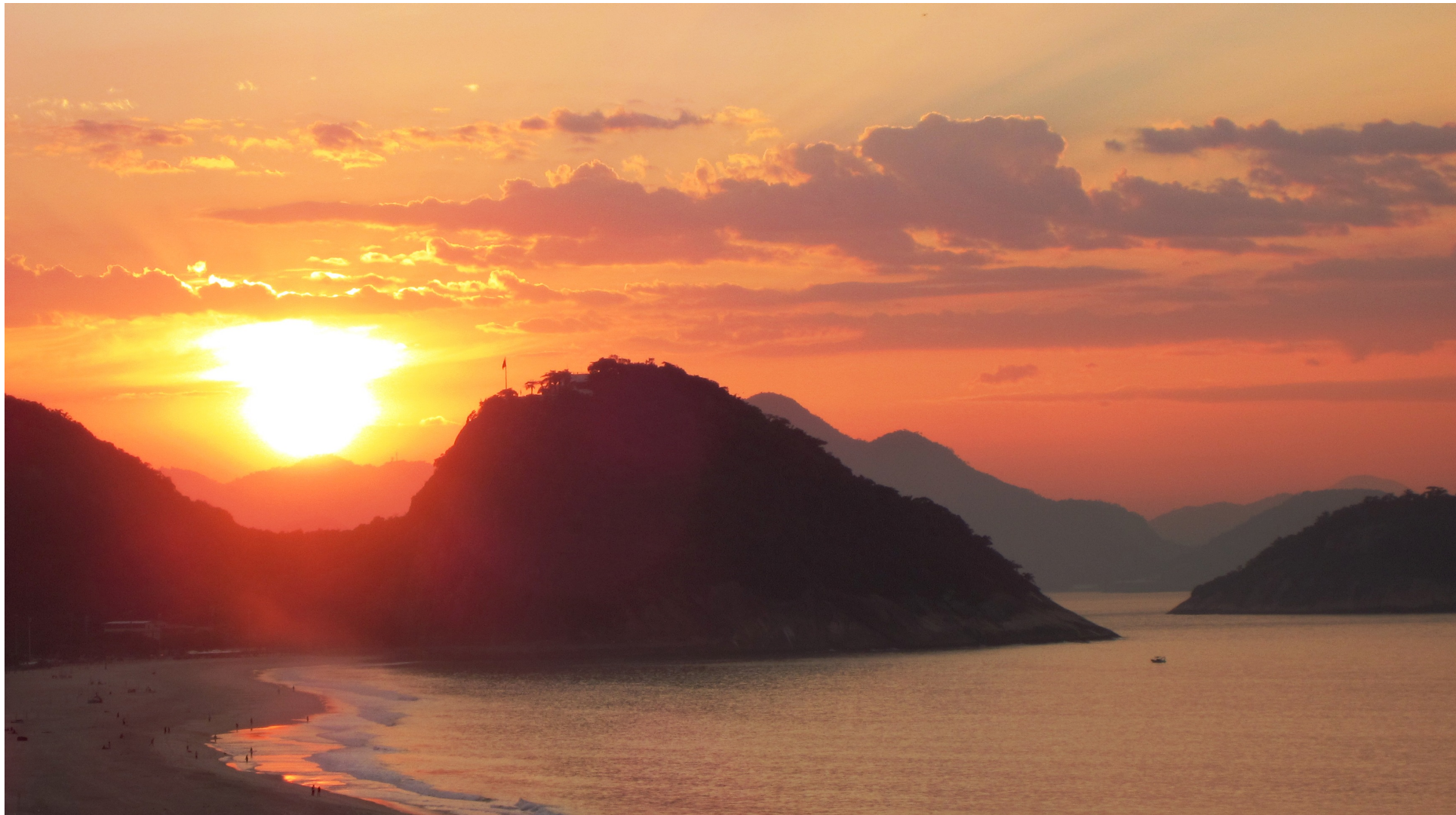
Rio de Janeiro, Sunrise

lsheehan@earthlaw.org www.earthlawcenter.org