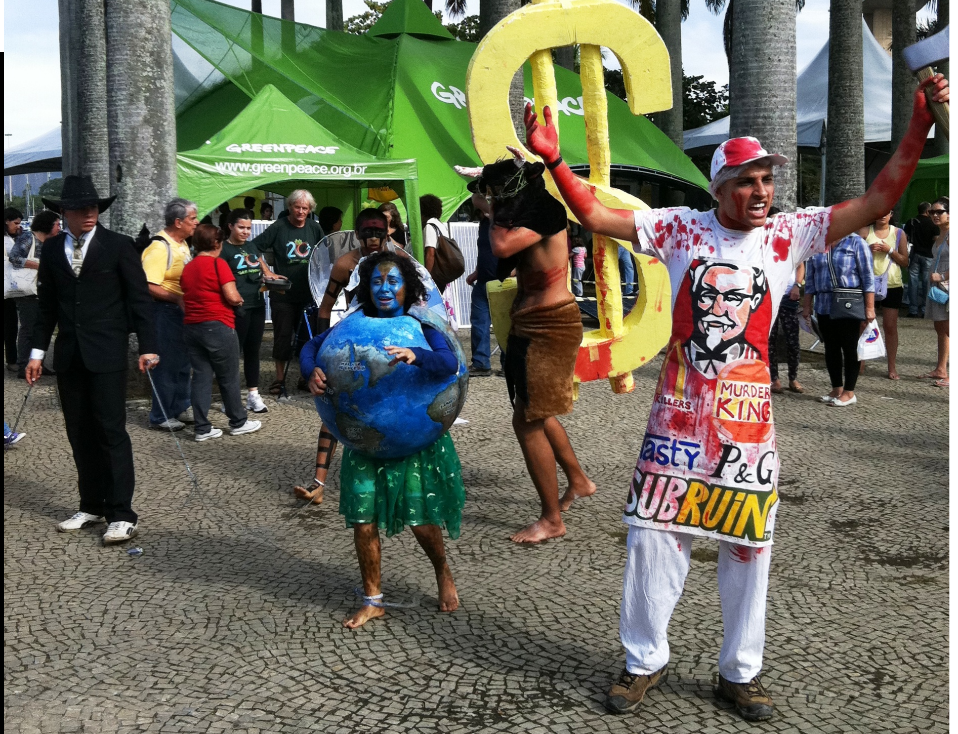
People's Summit, Rio +20