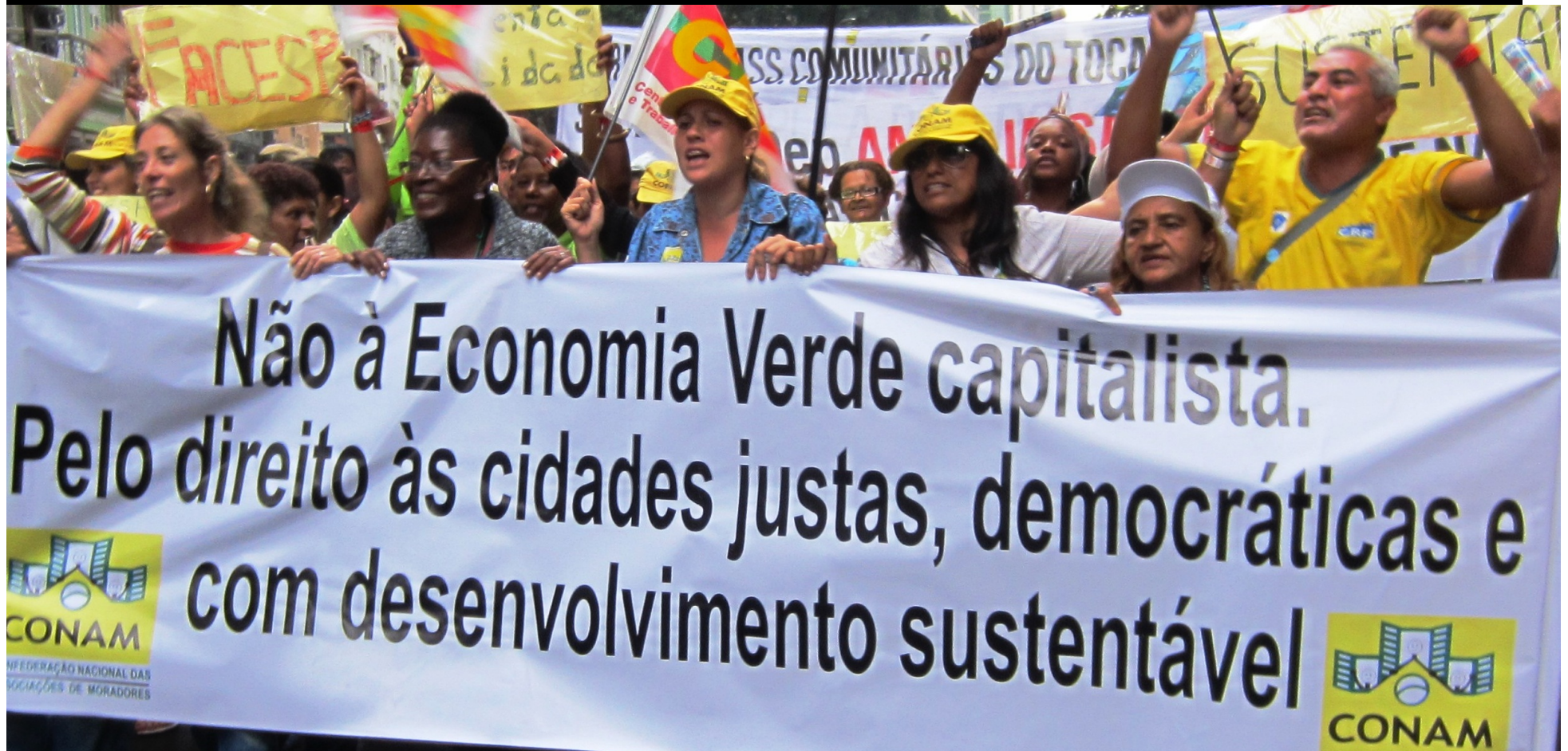
People's Summit March, Rio +20