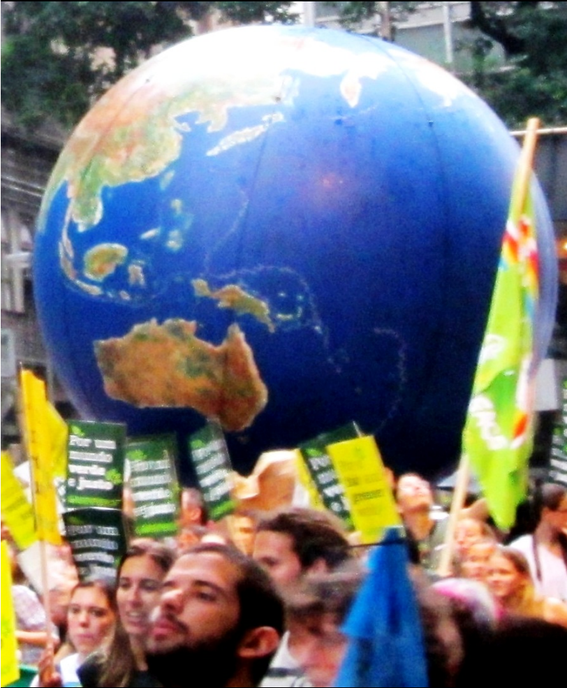
People's Summit March, Rio +20