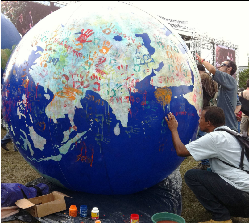
People's Summit, Rio +20