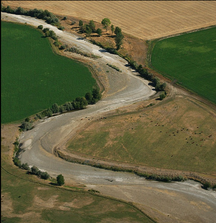
Scott River, CA, Sept. 2009