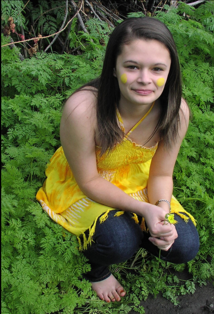
California Forest Sprite