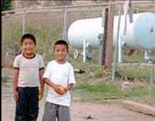
Waterkeeper Magazine, Summer '08