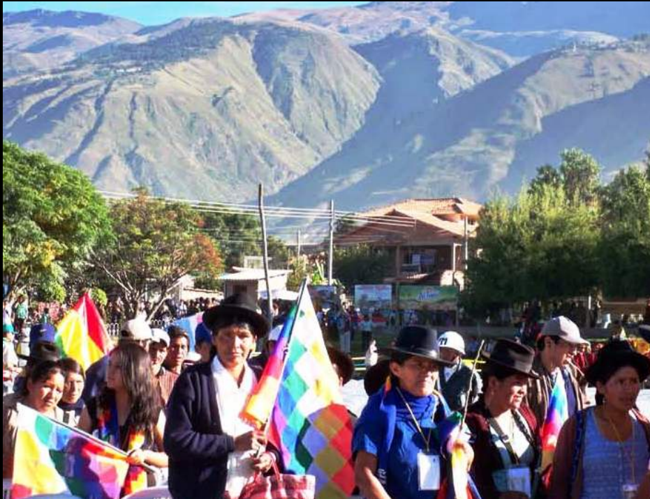
World People's Conference Cochabamba, Bolivia, April 2010