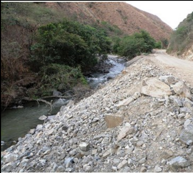
Road construction debris dumped into Vilcabamba River, Ecuador