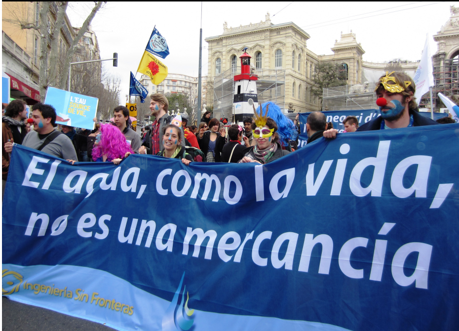
“Water for Life, Not for Sale” Marseille, France, March 2012