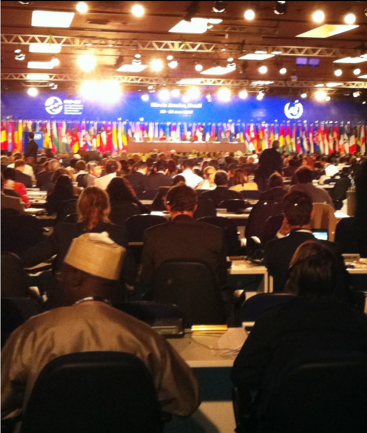
U.N. General Assembly, Rio +20