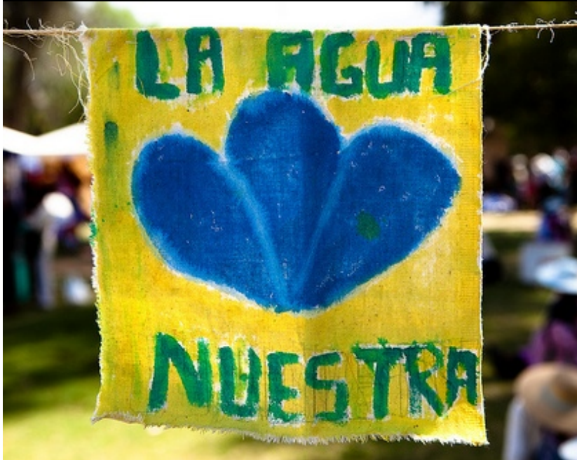
World People's Conference on Climate Change and the Rights of Mother Earth