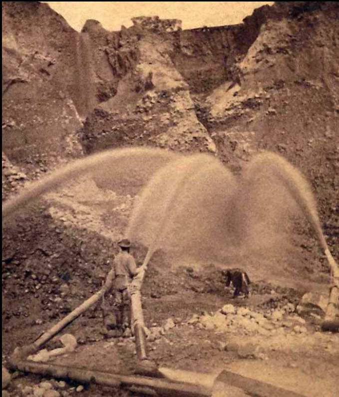
Hydraulic gold mining California Central Pacific Railroad History Museum