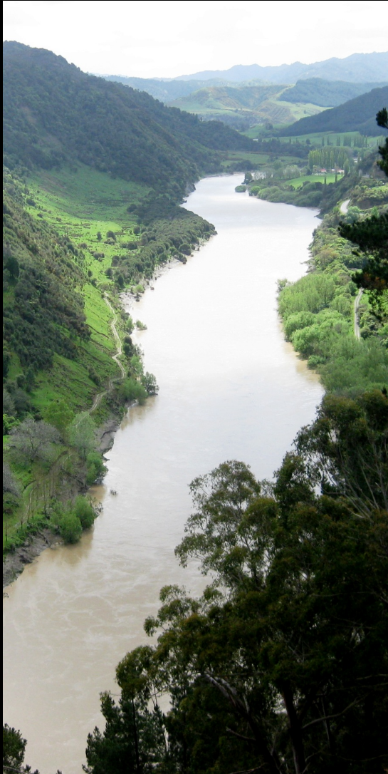
Whanganui River, NZ