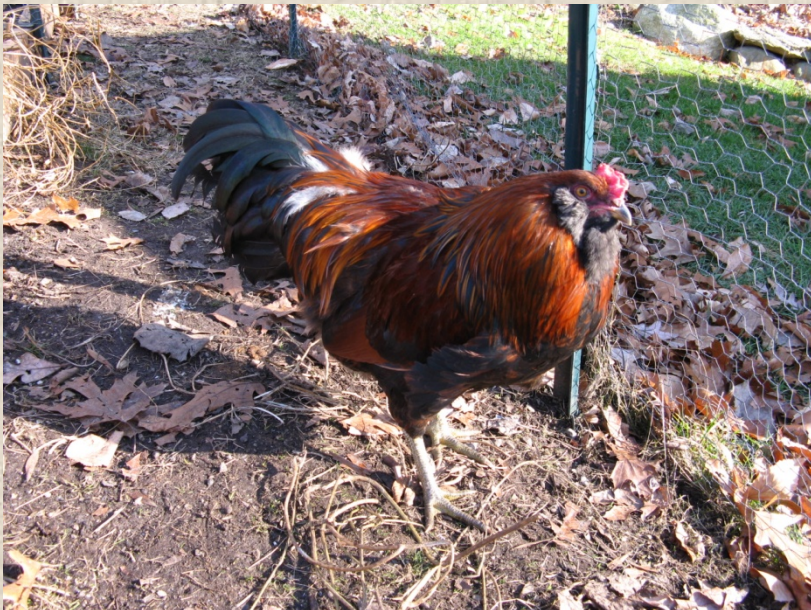
Amy Heid 2011