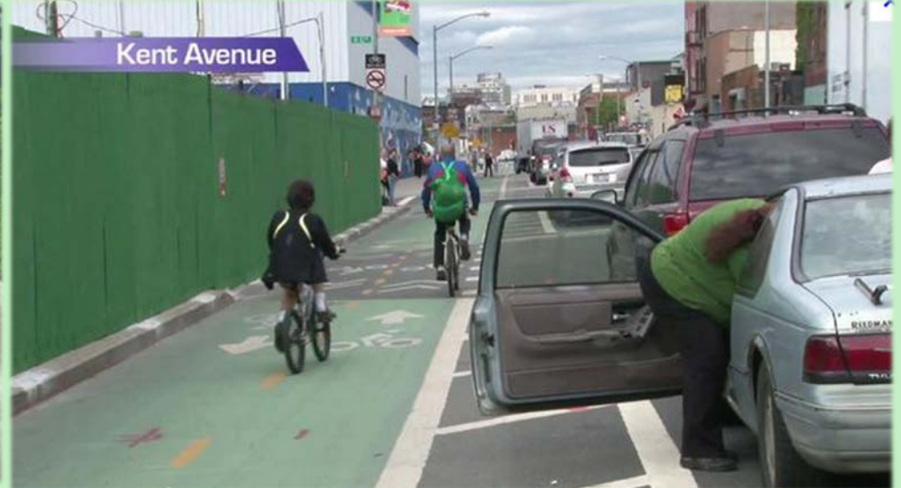
Kent Ave., New York City