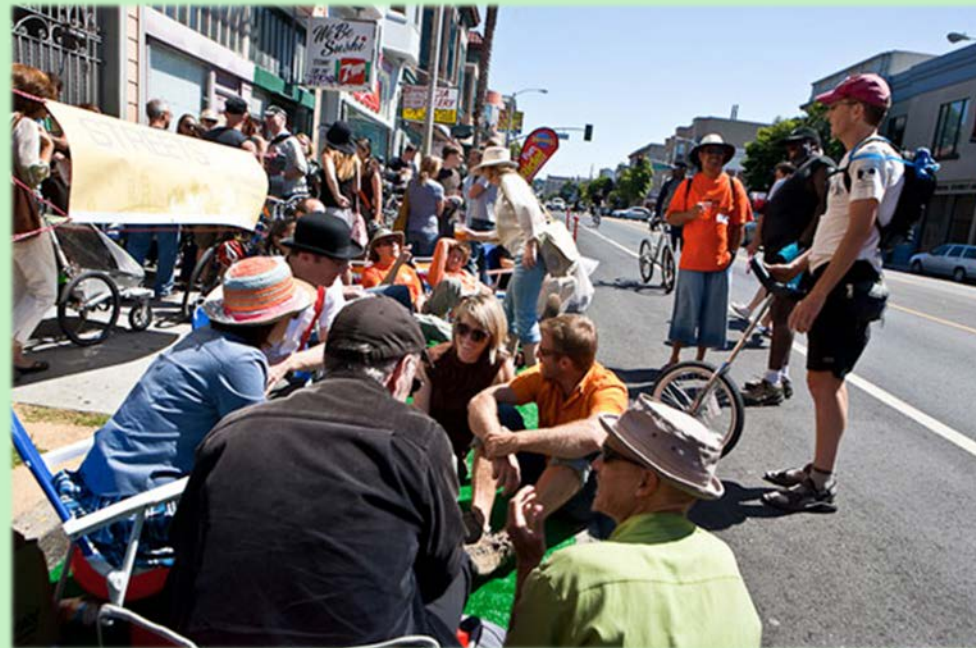
Valencia Street, San Francisco