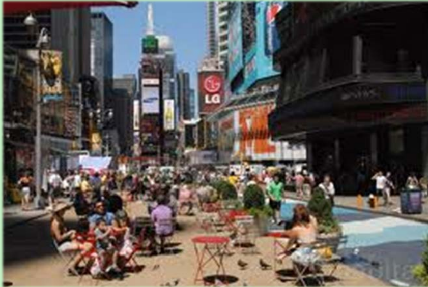
Times Square, NYC