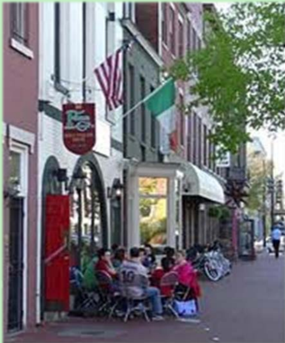
Barracks Row, D.C.