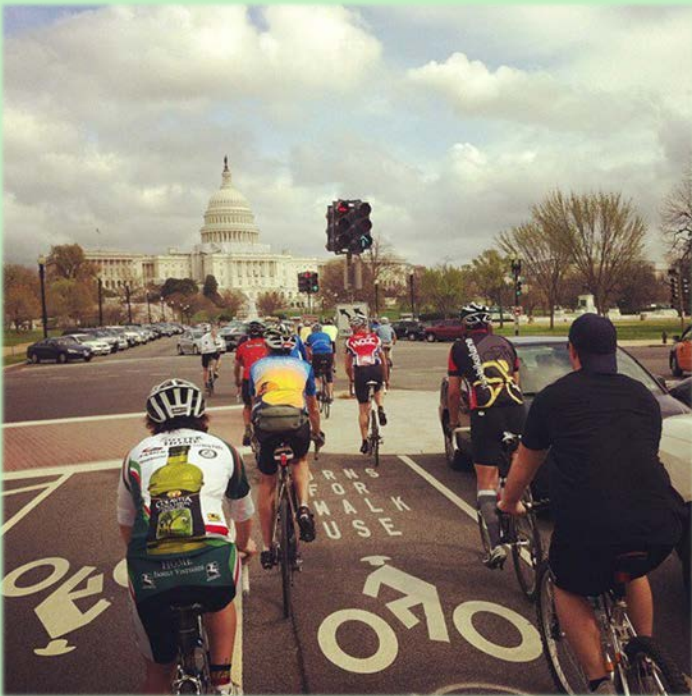
Pennsylvania Ave., Washington, D.C.