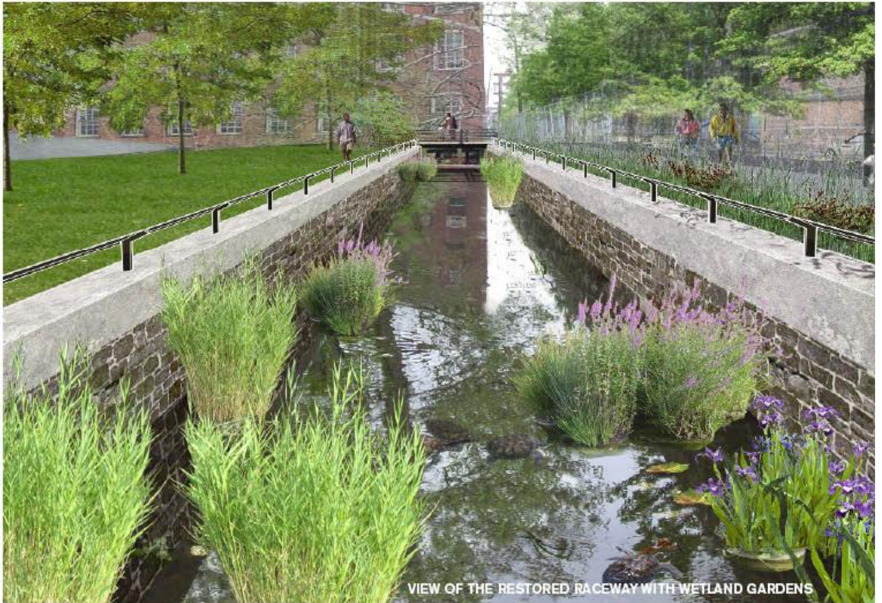
VIEW OF THE RESTORED RACEWAY WITH WETLAND GARDENS