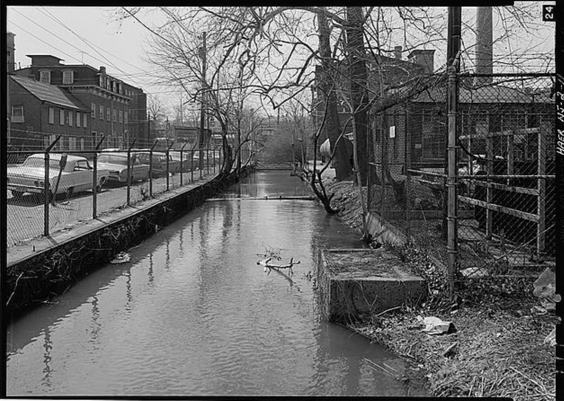
1973 Historic American Engineering Record photograph of the lower raceway