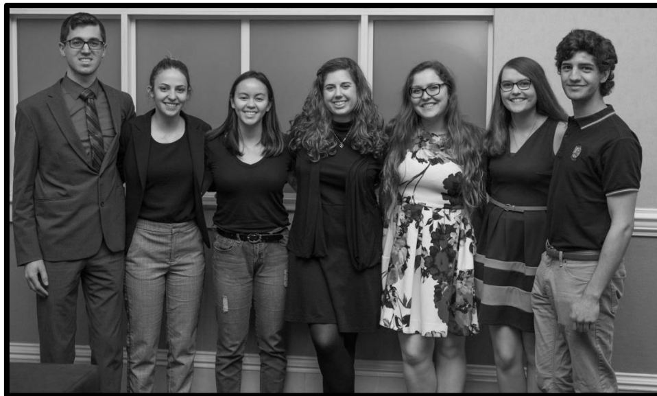
Students attending the NRHC Conference in Providence, RI

All of your Honors activity should be recorded for your personal records. In addition, you should complete sign-in requirements at every Honors event so that we can keep accurate records.