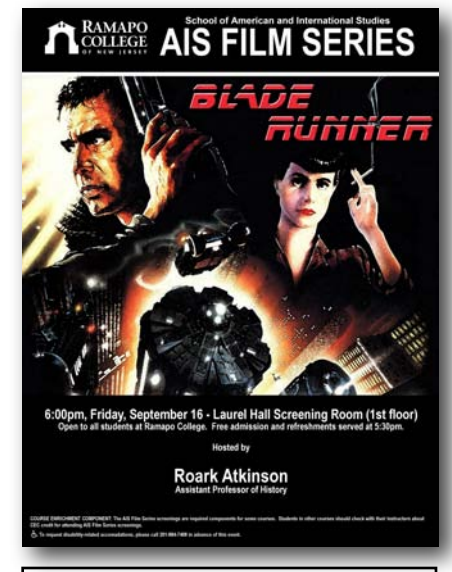
AIS Film Series