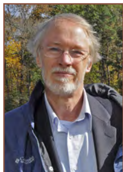
In October, the celebrated author Charles Baxter gave a lecture on fiction writing and then read in the Berrie Center's Sharp Theater.