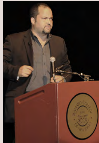
Ben Jealous speaks at Ramapo as part of the Dean's Lecture Series.

Another exciting development since my last letter is the challenge grant awarded