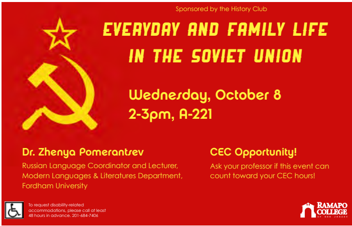
Soviet Union poster.