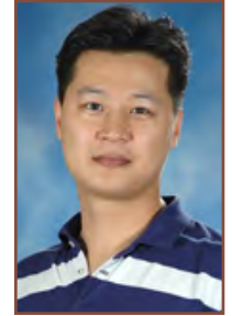
Professor Tae Kwak lectures for Colloquium Series in October.

showcase the work of some of our top students and local area scholars. Stay tuned for details!