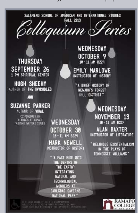
The SSHGS Fall Colloquium Series