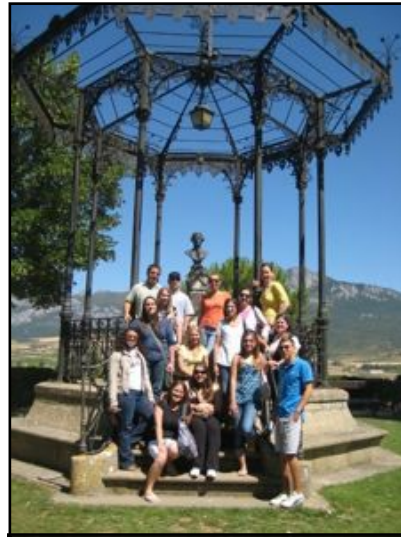
Statue of Felix Maria de Samaniego (Laguardia, Álava, Spain)

nation. The roundtable was a success: an exciting conversation ensued with students from other colleges.