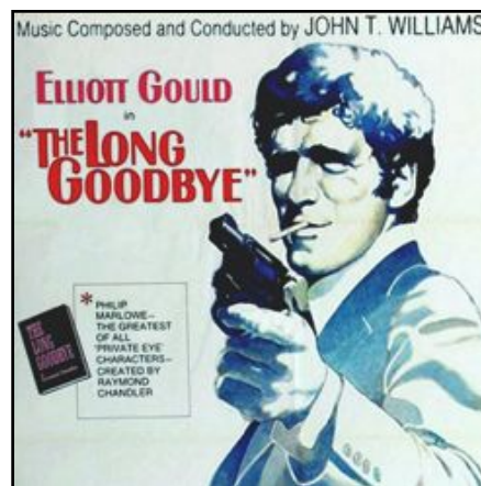
Poster from the 2010 AIS Film Series