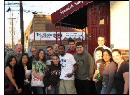
Dinner Spanish Peninsular Cuisine at Spanish Sangria Restaurant