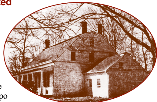
The Laroe-Van Horn House

The Ramapo Indians have had a continued presence in this area from prehistoric times up to the present. This study helps us understand the relations between Europeans and Indians during the contact period. The objects found at the Laroe-Van Horn House (pictured left) help to tell this story. Look for them on display at the Mahwah Museum (201 Franklin Tpke.; 201-512-0099) this fall. □