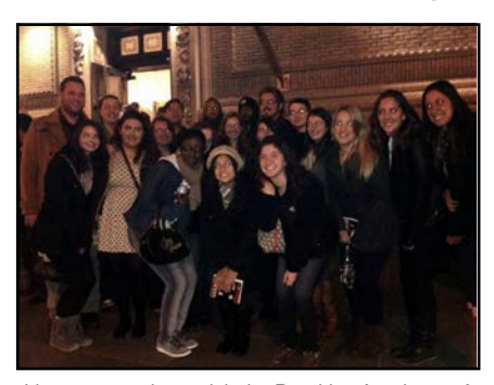
Literature students visit the Brooklyn Academy of Music