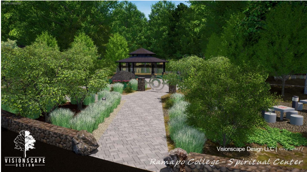
View into the rejuvenated outdoor spiritual center via the path entering near the Student Center.