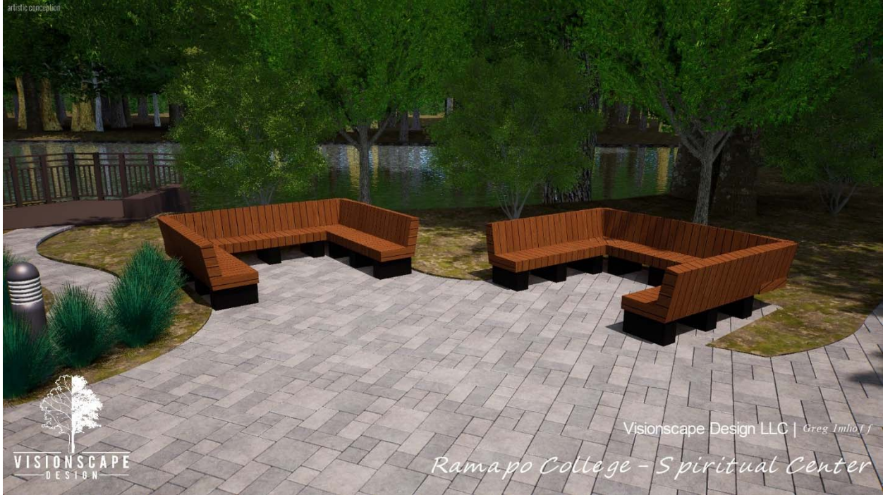
Close up view of new benches as facing Kameron Pond.