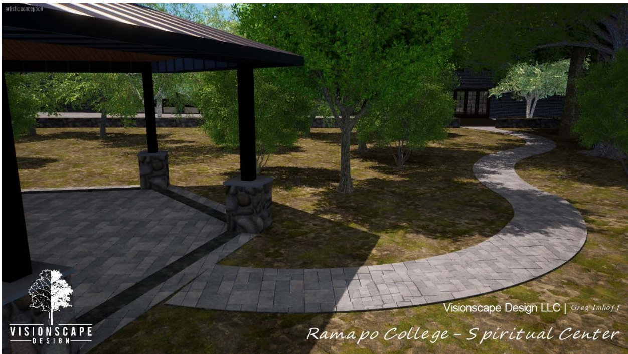
View from the proposed gazebo toward the entrance path as facing H-wing.