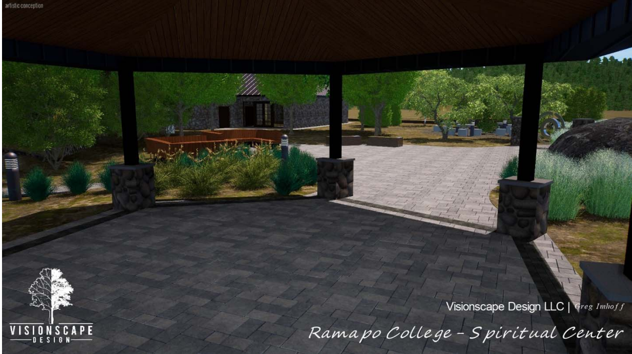
Reverse view from proposed gazebo toward new benches in the plaza connected to the Padovano Commons.