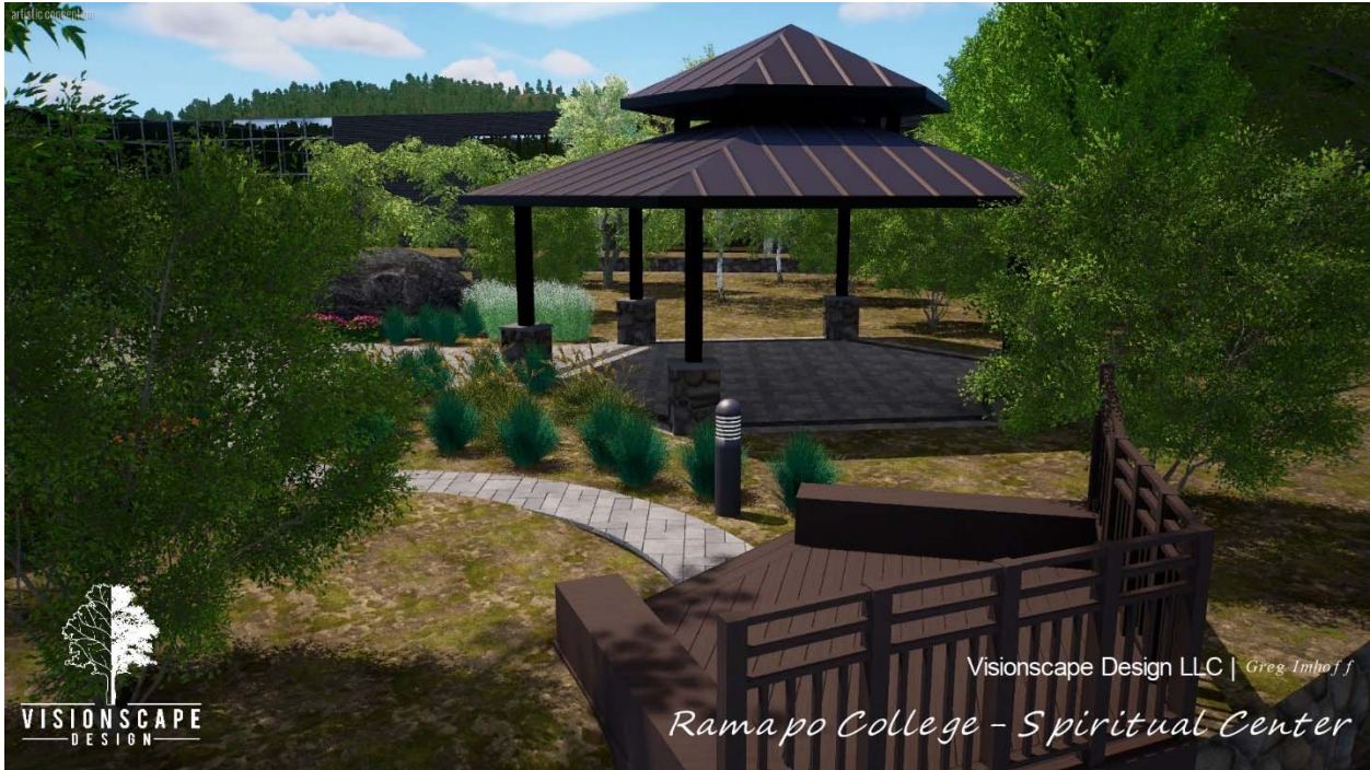
View from Kameron Pond toward the proposed gazebo and the main academic complex.