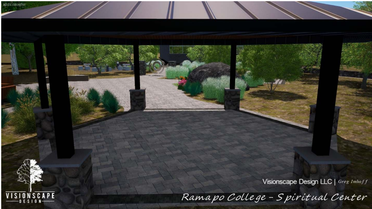
View from proposed gazebo toward main gate and the entrance near the Student Center.