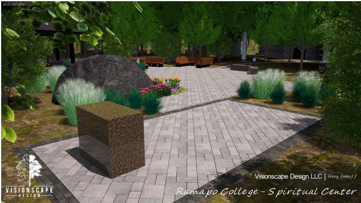
View of new benches as facing Kameron Pond with proposed gazebo on left and the Padovano Commons to the right.