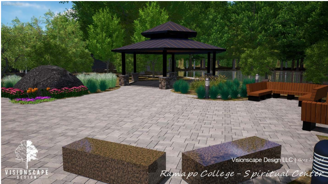
View into the proposed gazebo from the new benches in the plaza connected to the Padovano Commons.