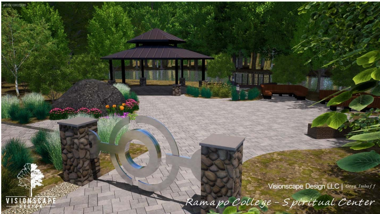
View into the rejuvenated outdoor spiritual center from the entrance gate.