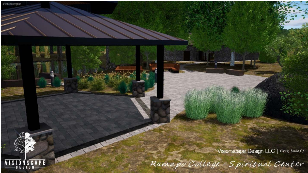
Similar view from outside the proposed gazebo toward new benches and the Padovano Commons.