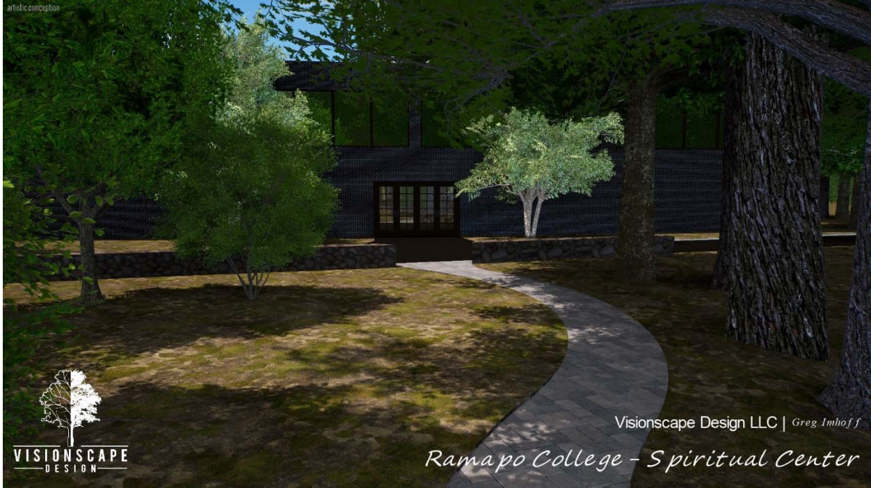
View from path as exiting toward H-wing.