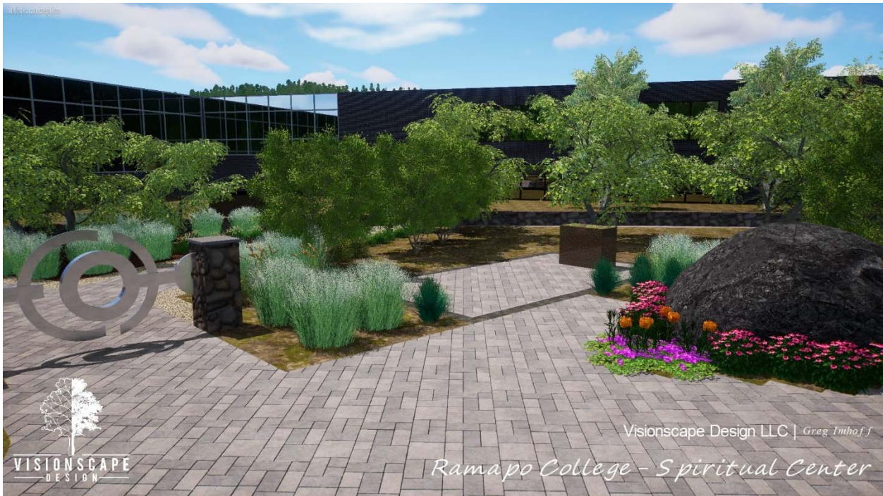
View from near the main gated entrance toward the academic complex.