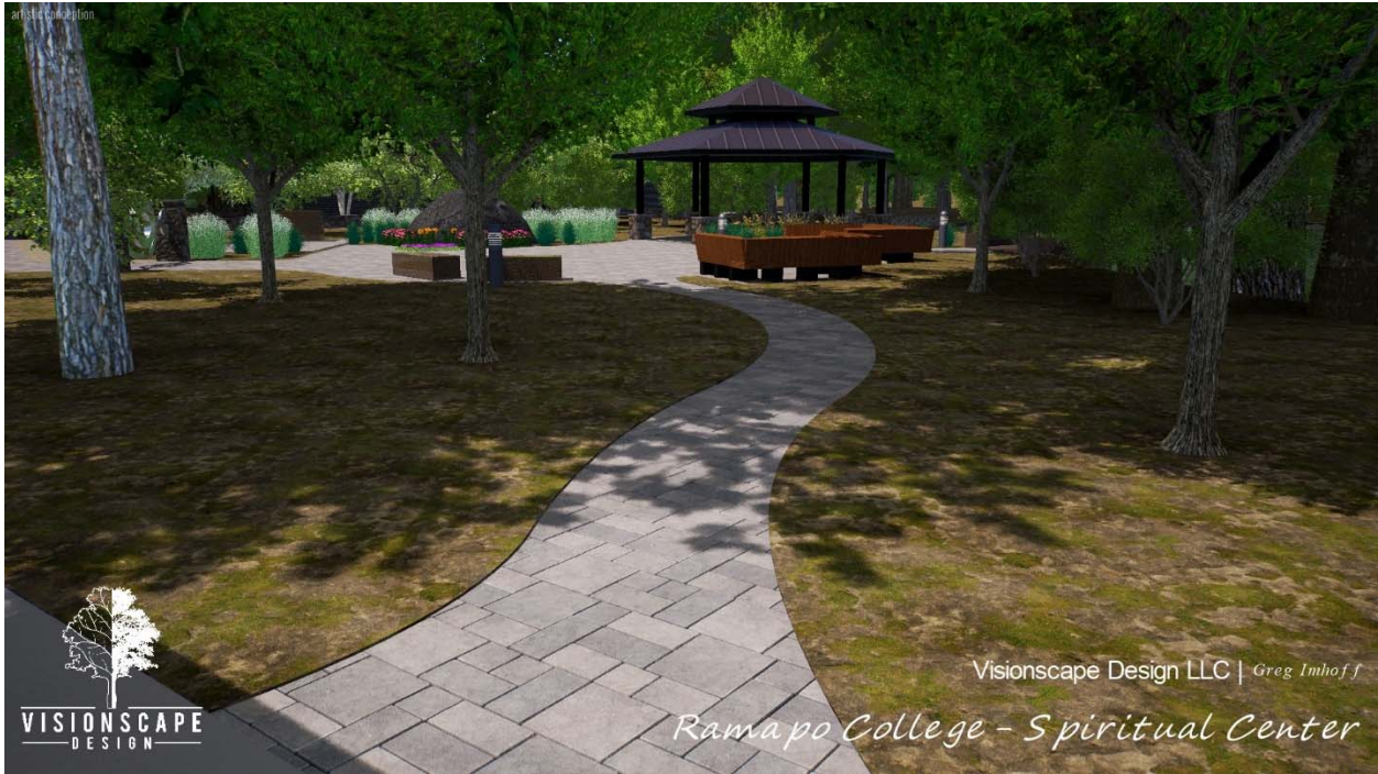
View into the rejuvenated outdoor spiritual center via the path entering near H-wing.