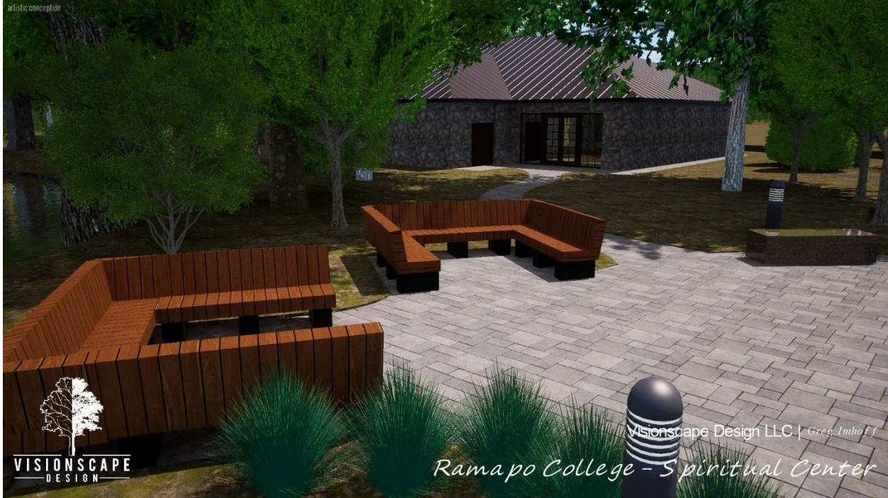
View of new benches as facing the Padovano Commons (with proposed gazebo to the rear).